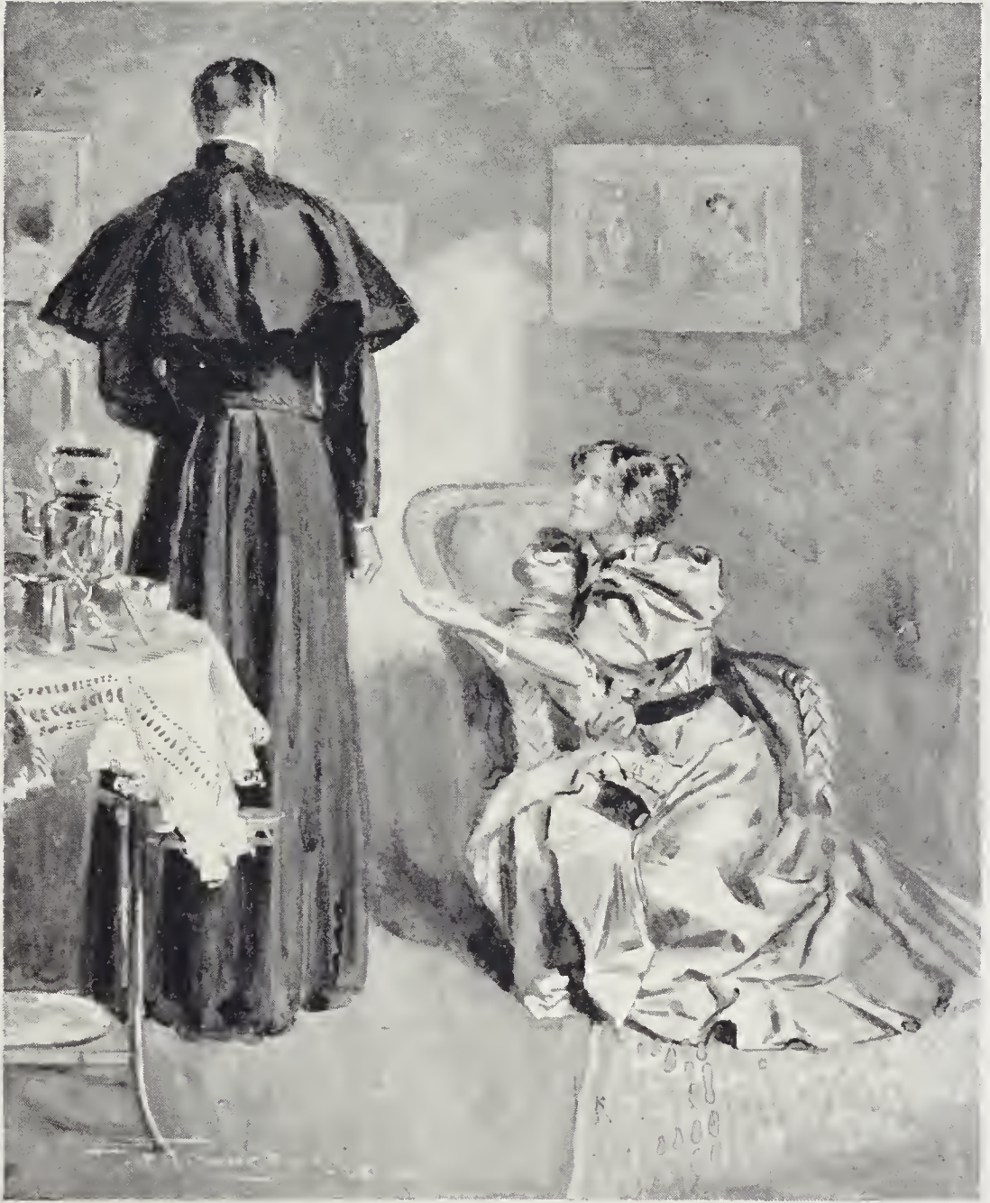
SHE CLINKED THE RUPEES TOGETHER AND HELD THEM OUT TO HIM